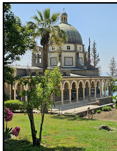
The Church of the Beatitudes