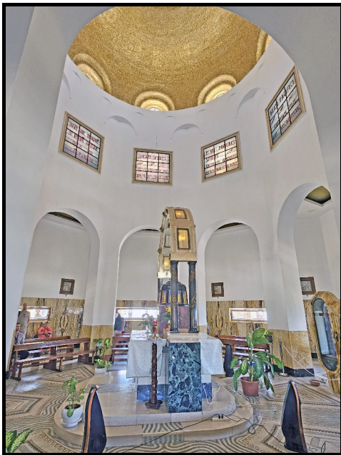
The altar with panels