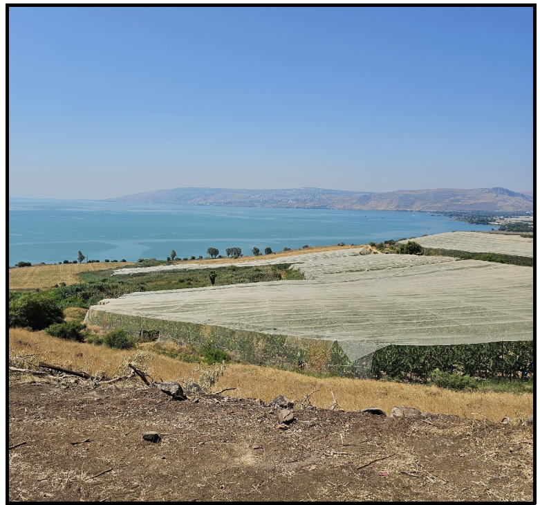
The hillside "amphitheater"