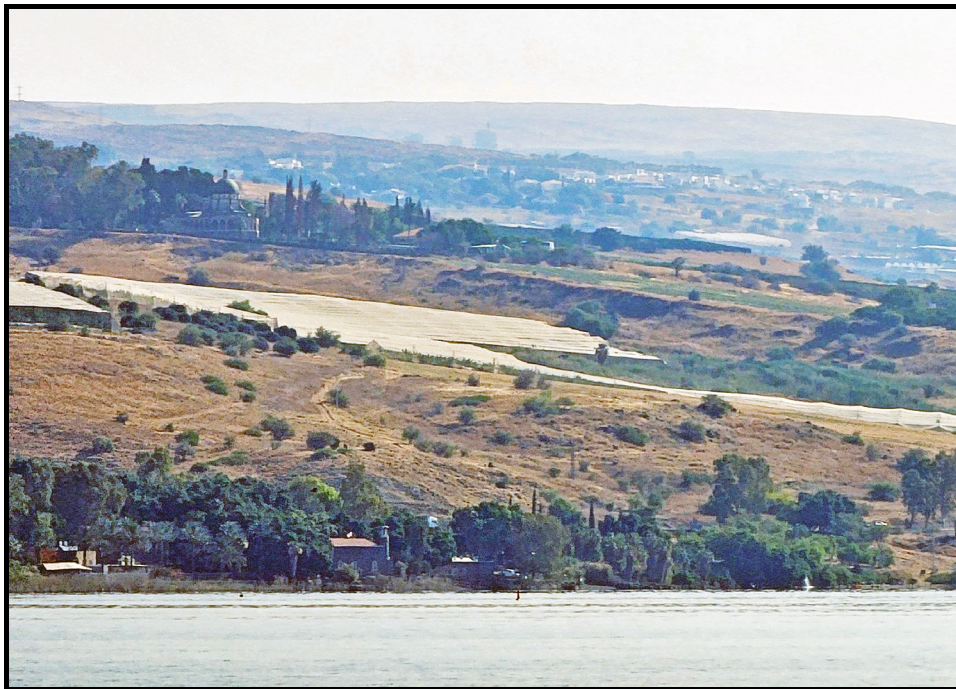
A view of the Church of the Beatitudes from the Sea of Galilee