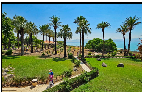
Church of the Beatitudes Grounds