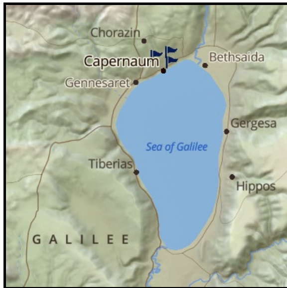
Jesus' ministry at the Sea of Galilee - Logos Maps