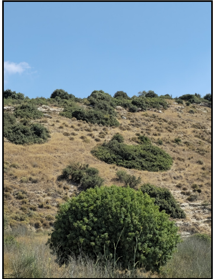
Location of the army of Saul