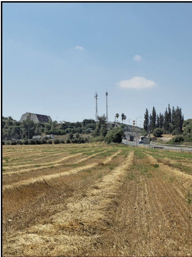
The Valley of Elah