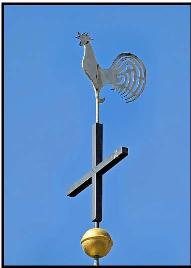
Saint Peter in Gallicantu