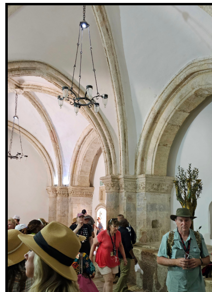
The Cenacle - possible site of the Upper Room

The other possible site of the Upper Room is the Monastery and Church of Saint Mark in the Old City of Jerusalem and near the Cenacle. According to a 6th-century inscription found in 1940 at the monastery, this is the site of the house of Mary, mother of Saint Mark the Evangelist, Acts 12:12. It is assumed that this is where Peter went when an angel released him from prison, Acts 12:12-17. The room is now underground but the relative altitude is correct since the streets of 1st century Jerusalem were at least twelve feet lower than those of today. A notice beside the door proclaims the Church of Saint Mark to be "The first church in Christianity." in the belief that it is on the site of the original house-church of Jerusalem's early Christians.