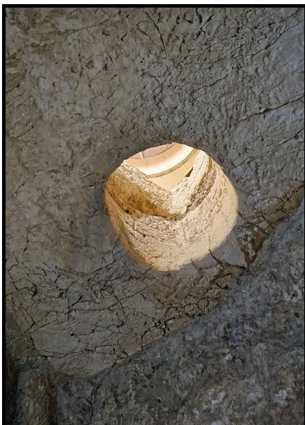
The possible hole in which our Savior was lowered