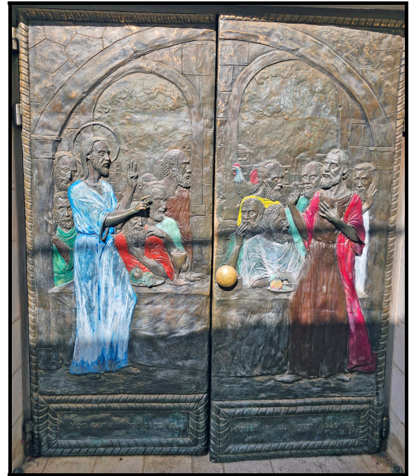
Jesus foretells Peter's betrayal