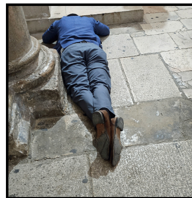
A man praying in the Cenacle

The Syriac Orthodox church believes Saint Mark's is location of the following events: