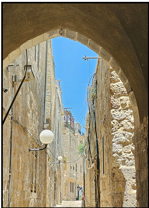
A street in the area of the Upper Room

The location of the Upper Room is not known for certain but two sites claim authenticity. The Cenacle (Latin for dining room ) is the site most people believe is the location of the Upper Room. It is possibly the site but not the actual room which was built in the 1200's AD. It had been turned into a mosque and still contains a mihrab , a niche in the wall facing Mecca. It is on Mount Zion in Jerusalem, just outside the Old City walls. The site is administered by Israeli authorities, and is part of a building that is supposedly over King David's tomb.