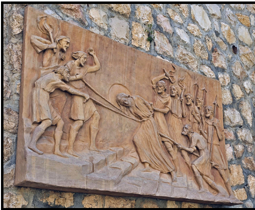
Jesus taken to Caiaphas' house

Betrayal can take many forms. None are immune to the possibility of betrayal. Peter succumbed but was wondrously restored by the grace of God in Christ. John 21:15-17, When they had finished breakfast, Jesus said to Simon Peter, "Simon, son of John, do you love me more than these?" He said to him, "Yes, Lord; you know that I love you." He said to him, "Feed my lambs." 16 He said to him a second time, "Simon, son of John, do you love me?" He said to him, "Yes, Lord; you know that I love you." He said to him, "Tend my sheep." 17 He said to him the third time, "Simon, son of John, do you love me?" Peter was grieved because he said to him the third time, "Do you love me?" and he said to him, "Lord, you know everything; you know that I love you." Jesus said to him, "Feed my sheep."