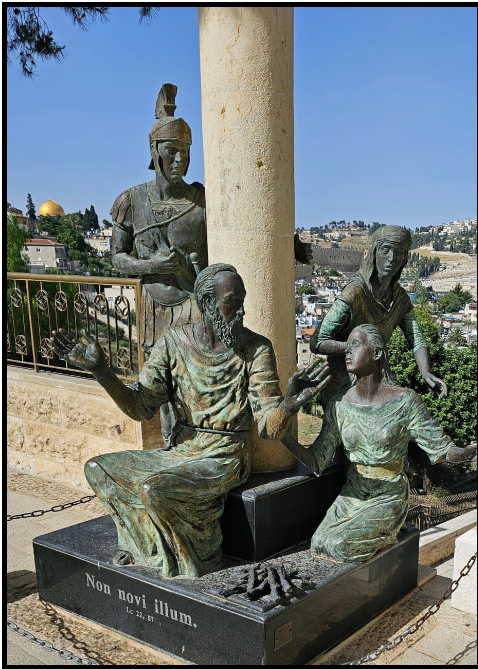
Peter's triple betrayal of Jesus

Betrayal can take many forms. None are immune to the possibility of betrayal. Peter succumbed but was wondrously restored by the grace of God in Christ. John 21:15-17, When they had finished breakfast, Jesus said to Simon Peter, "Simon, son of John, do you love me more than these?" He said to him, "Yes, Lord; you know that I love you." He said to him, "Feed my lambs." 16 He said to him a second time, "Simon, son of John, do you love me?" He said to him, "Yes, Lord; you know that I love you." He said to him, "Tend my sheep." 17 He said to him the third time, "Simon, son of John, do you love me?" Peter was grieved because he said to him the third time, "Do you love me?" and he said to him, "Lord, you know everything; you know that I love you." Jesus said to him, "Feed my sheep."