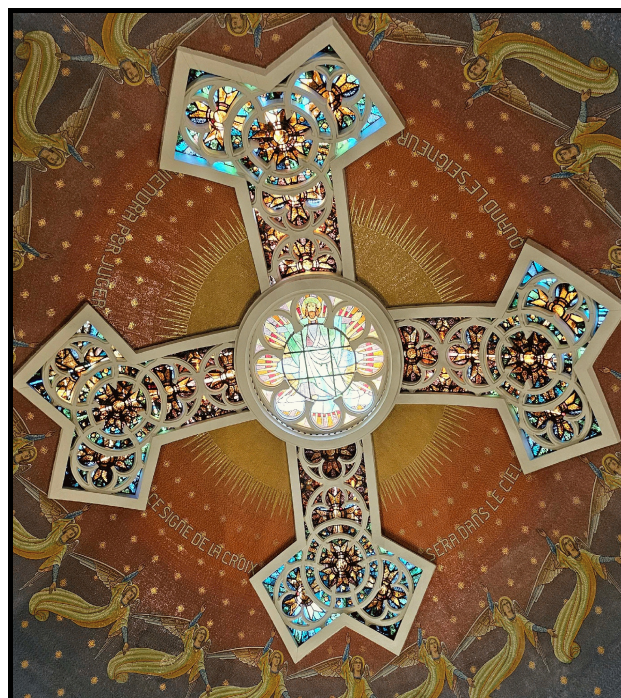
Jesus coming in the clouds