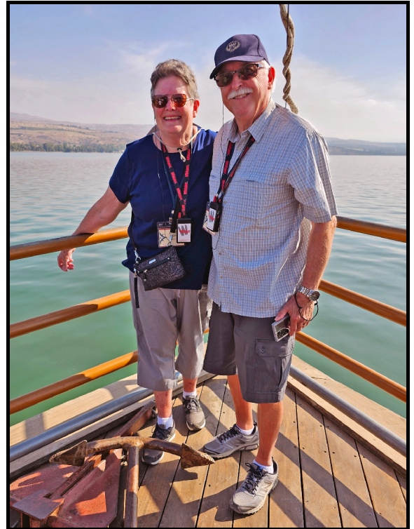
What a joy to be where Jesus ministered!