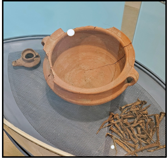
Actual items found in the unearthed boat