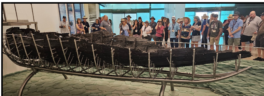
The actual Jesus Boat in the Yigal Alon Center