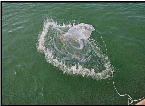
Jesus can make us fishers of men and women.