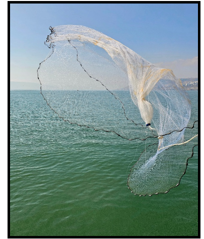
The type of net used in the 1 st C.