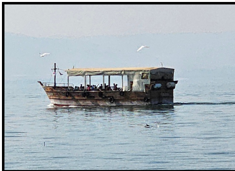
A tourist boat on the Sea of Tiberias (Galilee)