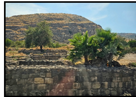
The remains to the entrance to Tiberias' thermal baths.