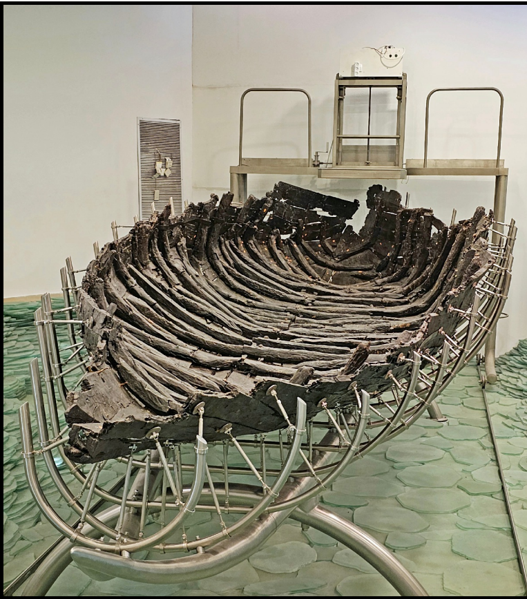
A view from the bow of the Jesus Boat