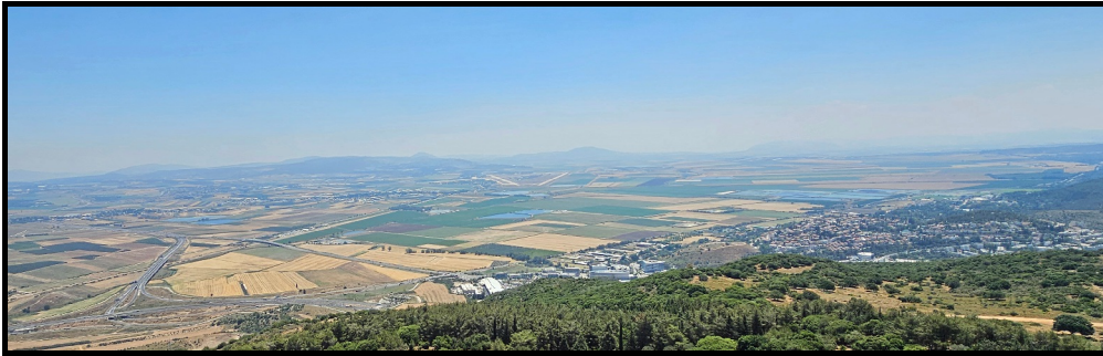
The Valley of Jezreel and the International Highway