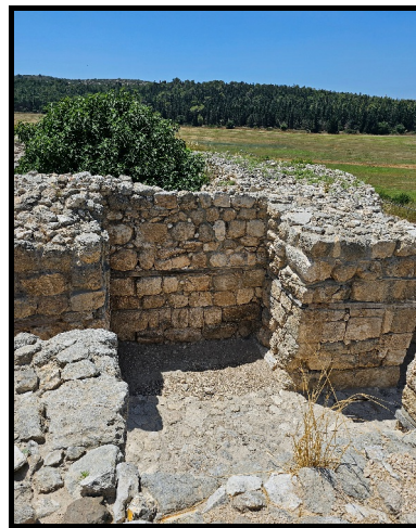
Megiddo City Gate