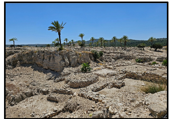
Megiddo Sacred Temple area