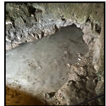
Tunnel meets the spring