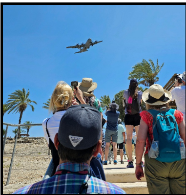
Israeli Air Force plane over Megiddo