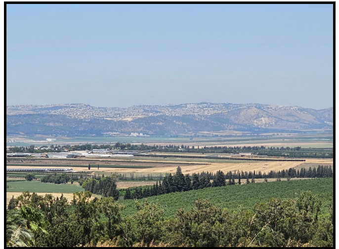
Looking toward Nazareth