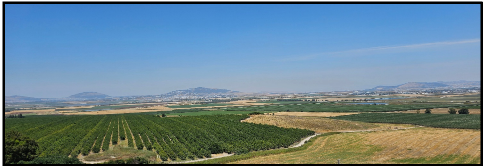
Left to right: Mt. Tabor, Hill of Moreh and Mt. Gilboa