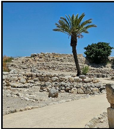
Foundations of Megiddo Northern Palace