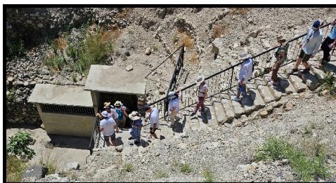
Megiddo Water Tunnel Entrance